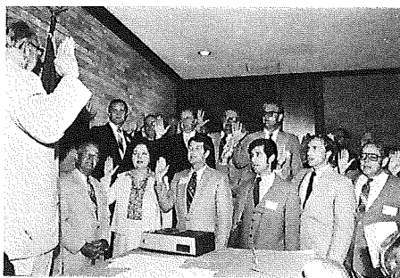
Chief Justice Joe Greenhill, far left, administers the oath of office.

As the result of passage of S.B. 265 by the 67th legislature, the 14 courts of appeals will now have criminal as well as civil jurisdiction. Texas voters in 1980 authorized a constitutional change to allow for this modification in the judicial system. The legislation also provided for the addition of 28 new judges to appellate courts, 24 of whom were appointed in August by Governor Clements. Four new appellate judges will be added next year. Twenty-three of